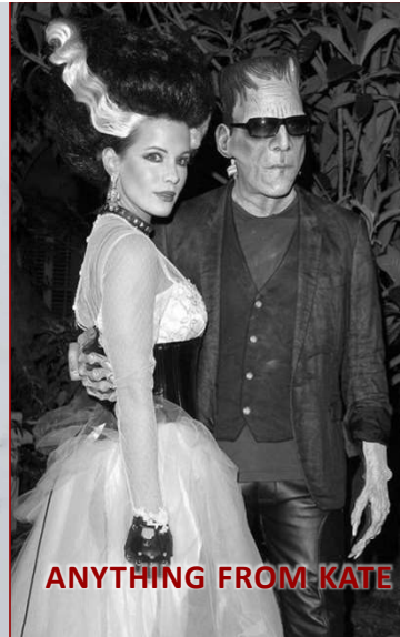
ANYTHING FROM KATE

You can be creative with your costuming by accessing as many resources as possible. I always suggest following a “ bits and bobs ” approach by recycling, repurposing, and re-imagining... there is literally inspo everywhere!