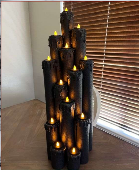
Pool noodle candles