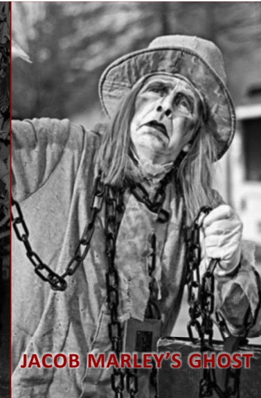
JACOB MARLEY'S GHOST