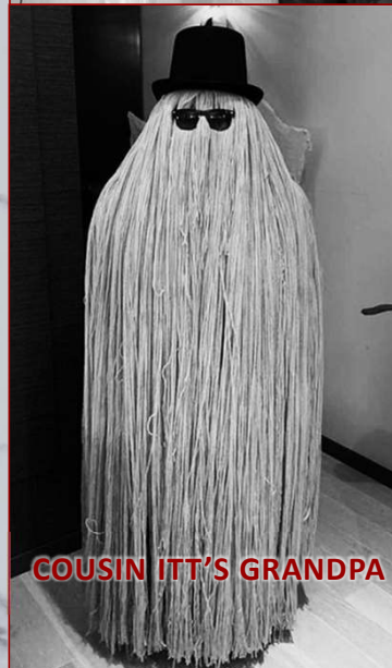
COUSIN ITT'S GRANDPA