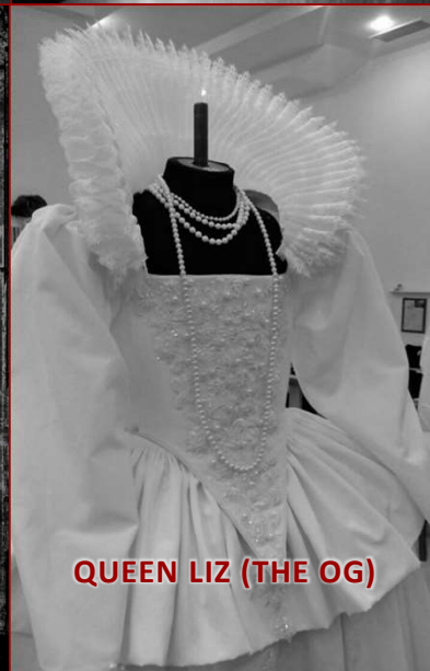
QUEEN LIZ (THE OG)